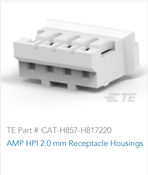
TE Part # CAT-H857-H817220 AMP HPI 2.0 mm Receptacle Housings