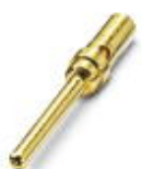
D-SUB crimp contact, connection method: Crimp connection, connection cross section: AWG 24- 20

D-SUB crimp contact - CUC-DSC-C1BAU-S/DSC24 - 1418786