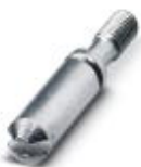
Coding peg for coding up to 16 connectors, for HC Modular