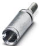
Coding socket for coding up to 16 connectors, for HC Modular