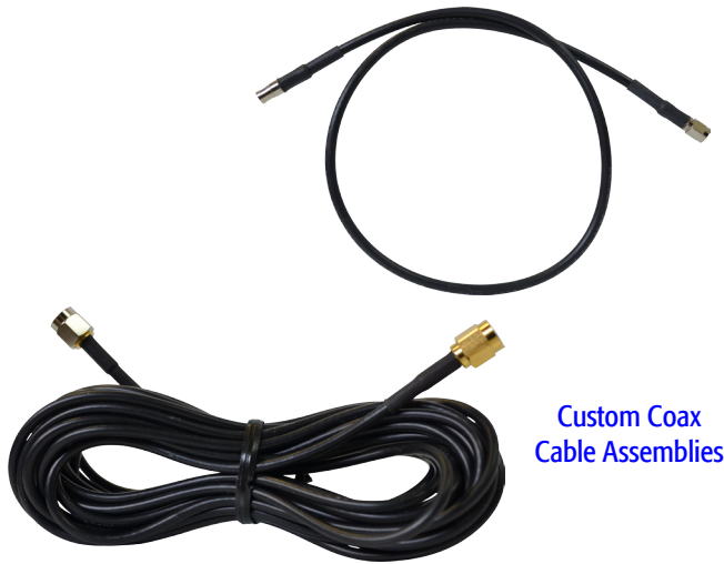
Custom Coax Cable Assemblies