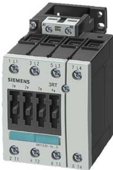
CONTACTOR, AC-1 60 A, AC 240 V, 50 HZ, 4-POLE, SIZE S2, SCREW CONNECTION