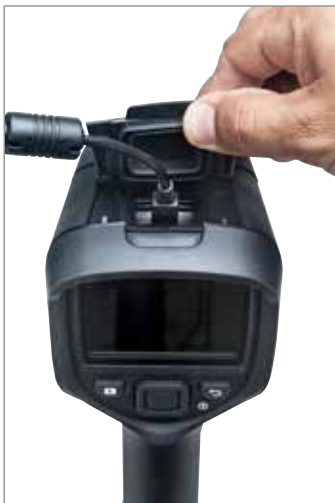
Download images fast via USB

Specifications are subject to change without notice. For the most up-to-date specifications, go to www.flir.com