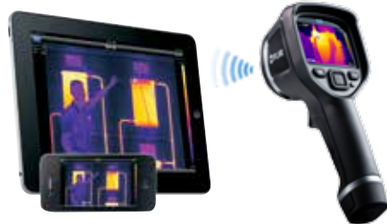
Wireless Connectivity to Smartphones, Tablets and more.