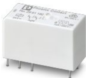
Plug-in miniature power relay, with power contact, 2 PDTs, input voltage 24 V DC

Please be informed that the data shown in this PDF Document is generated from our Online Catalog. Please find the complete data in the user's documentation. Our General Terms of Use for Downloads are valid ( http://phoenixcontact.com/download )