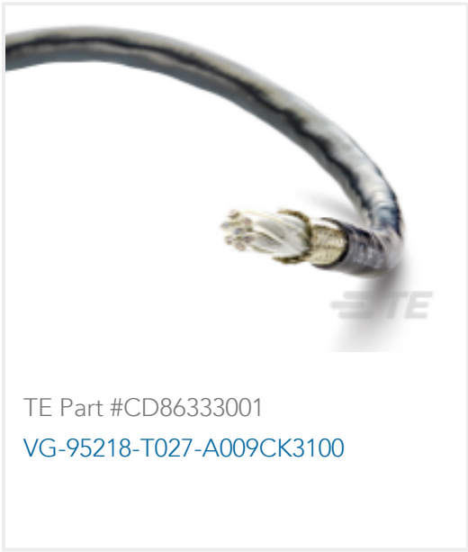
TE Part #CD86333001 VG-95218-T027-A009CK3100