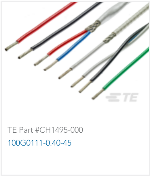
TE Part #CH1495-000 100G0111-0.40-45