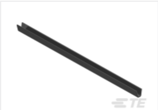
TE Part #7574442007 RAYRIM-NR8-0-STK