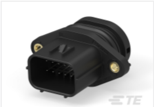
TE Part #2278701-4 12P THROUGH WALL CONNECTOR