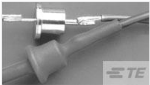
TE Part #5677964005 RNF-3000-39/13-X-SP