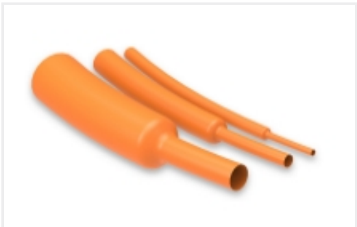
Orange Heat Shrink Tubing(1)