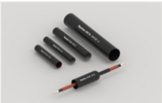
Power Cable Tubing & Accessories(8)