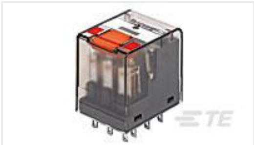
TE Part #8-1419111-1 PT570048