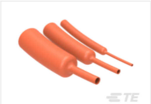
TE Part #CAT-HST-CGPT1 CGPT 2:1 Heat Shrink Tubing