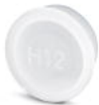
Plastic dust protection cap for connectors with M23 external thread

Plastic dust protection cap - RC-Z2059 - 1604225