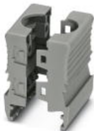
Cable housing, Length: 19.9 mm, Width: 42 mm, Height: 36.8 mm, Number of positions: 12, Color: gray

Please be informed that the data shown in this PDF Document is generated from our Online Catalog. Please find the complete data in the user's documentation. Our General Terms of Use for Downloads are valid ( http://phoenixcontact.com/download )