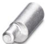
Cable lug for HEAVYCON-MODULAR; PE connection extension to 16 mm 2 , for crimping with crimp pliers