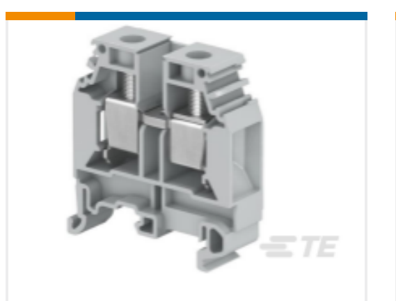
TE Part # 1SNA400193R2000 M16/12