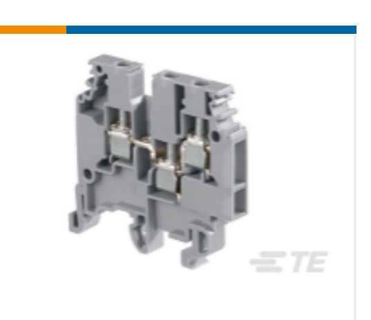
TE Part #1SNA125468R2200 M4/6.3A.N