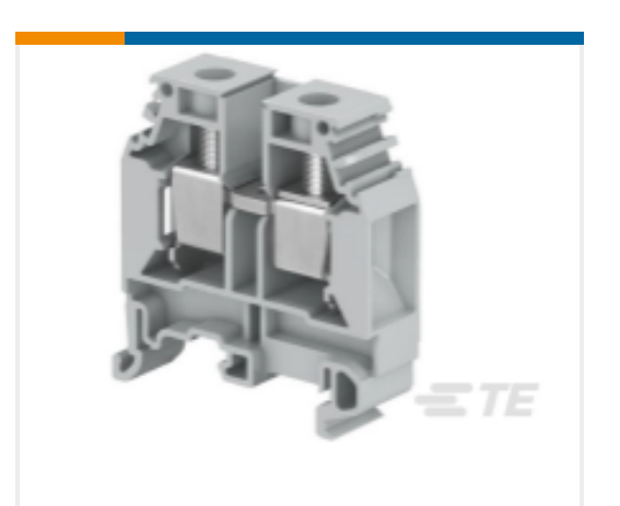
TE Part # 1SNA400192R2700 M16/12