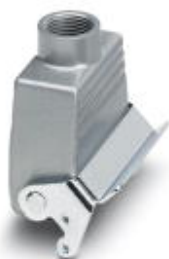
HEAVYCON coupling housing D15, with single locking latch, height 48 mm, with support 1xM20

Please be informed that the data shown in this PDF Document is generated from our Online Catalog. Please find the complete data in the user's documentation. Our General Terms of Use for Downloads are valid ( http://phoenixcontact.com/download )