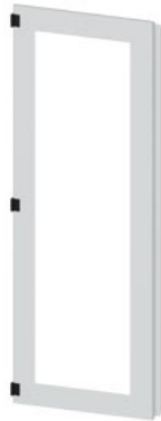
SIVACON, door half, left, inspection window, IP55, H: 1800 mm, W: 600 mm, RAL 7035, protection class 1