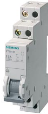
Group switch 20 A 2 groups