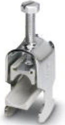
Cable clamp, for DIN rails

Please be informed that the data shown in this PDF Document is generated from our Online Catalog. Please find the complete data in the user's documentation. Our General Terms of Use for Downloads are valid ( http://download.phoenixcontact.com )