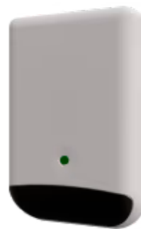
Universal IR to Modbus RTU - 1 indoor unit

The Universal Infrared (IR)-Modbus RTU device allows complete and natural integration of any air conditioner unit equipped with an infrared receiver into Modbus RTU systems. Thanks to the device's capability of emitting and receiving IR signals, the AC unit can be controlled simultaneously by both the Modbus RTU system and the IR remote.