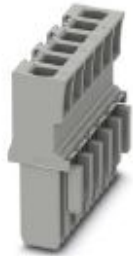
Connector housing, color: gray

Please be informed that the data shown in this PDF Document is generated from our Online Catalog. Please find the complete data in the user's documentation. Our General Terms of Use for Downloads are valid ( http://phoenixcontact.com/download )