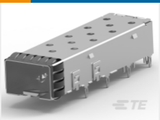
TE Part # 2007215-1 SFP+ 1x1 Cage Assy, PCI, Press