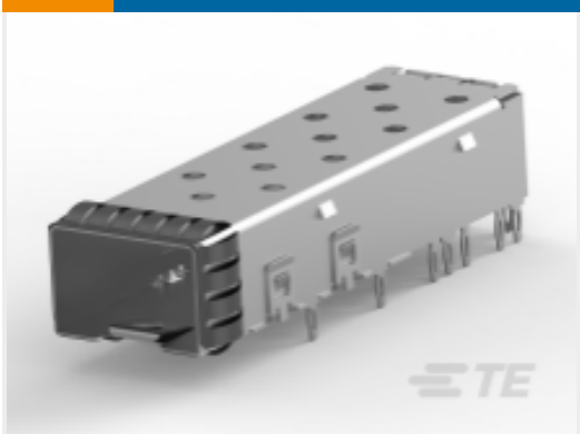
TE Part # 2057159-1 SFP+ 1x1 Cage Assy, Press-Fit, 20 Pin