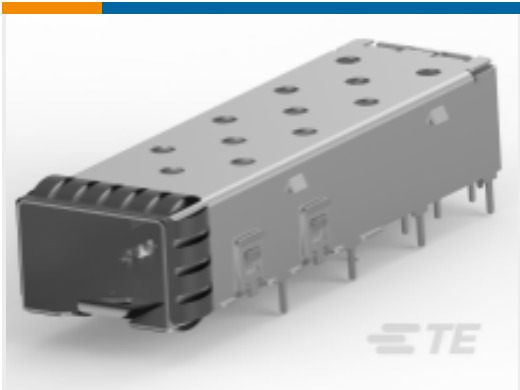
TE Part # 2110304-1 SFP+ 1x1 Cage Assembly, Solder Tail