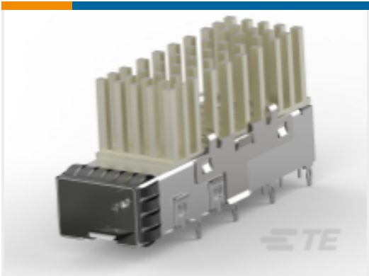
TE Part # 2007464-3 SFP+ 1x1 Cage Assy, PF,with Heatsink