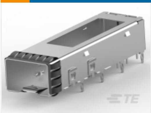
TE Part # 2007198-2 SFP+ 1x1 Cage Assembly, Press-Fit