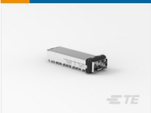
TE Part # 2057086-2 SFP+ Enhanced 1x1 Cage Assembly