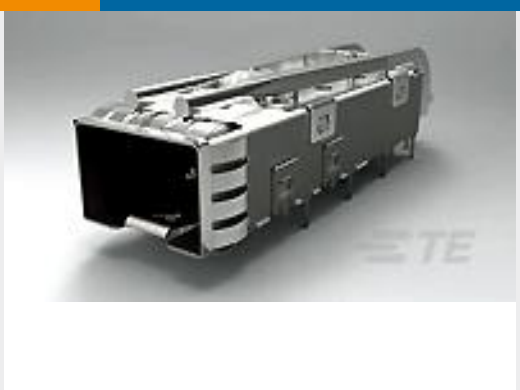
TE Part # 2170193-1 SFP+ 1x1 Cage Assembly,w/ Light Pipe