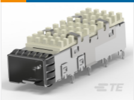
TE Part # 2007464-1 SFP+ 1x1 Cage Assy, PF,with Heatsink