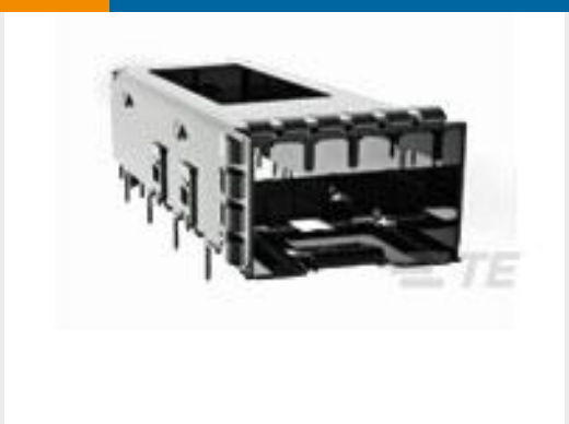
TE Part # 2007215-2 SFP+ 1x1 Cage Assy, PCI, Press Fit