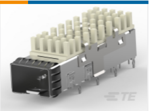
TE Part # 2007464-2 SFP+ 1x1 Cage Assy, PF,with Heatsink