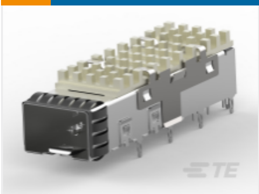
TE Part # 2007277-1 SFP+ 1x1 Cage Assy, PCI, PF, Heatsink