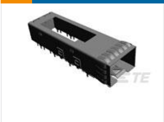
TE Part # 2057021-1 SFP+ 1x1 Cage Assy, Short Solder Tail