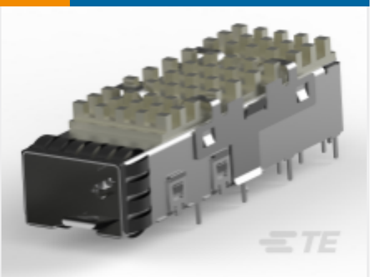
TE Part # 2007193-1 SFP+ 1x1 Cage Assembly, PCI, S