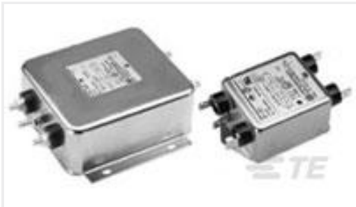
TE Part #6609042-4 20VS1=F7249 S0