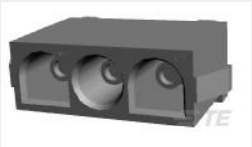
TE Part #350760-4 03P UMNL HDR ASSY PC