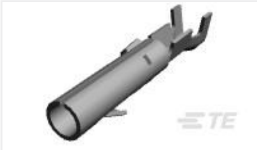
TE Part #61314-4 CMNL SOK 24-18 TPPHBZ