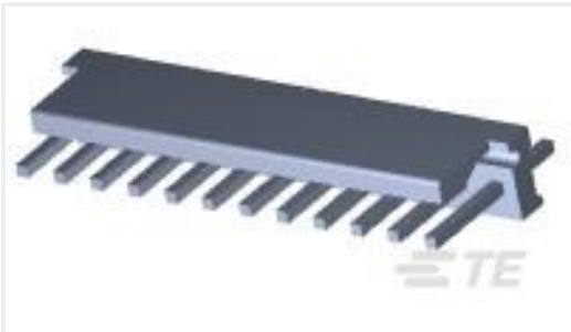
TE Part #1-644752-2 12P MTA156 HDR ASSY SQ STR F/L