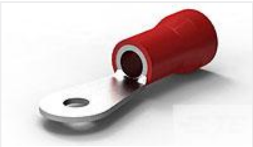
TE Part #52041-3 TERMINAL,R PG 8 1/4