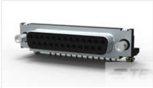
TE Part #5747846-6 25 MSFL RCPT RA 318 (SL,FM,BL)