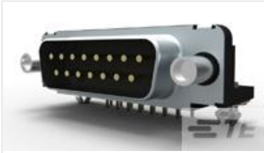
TE Part #5747841-6 15 MSFL PLUG RA 318 (SL,FM,BL)