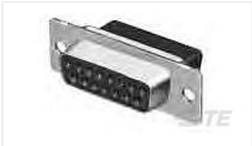
TE Part #205209-2 RECP ASSY SIZE 4