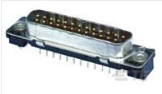
TE Part #1-5745968-3 25 PLUG SP/FMS SCRLK