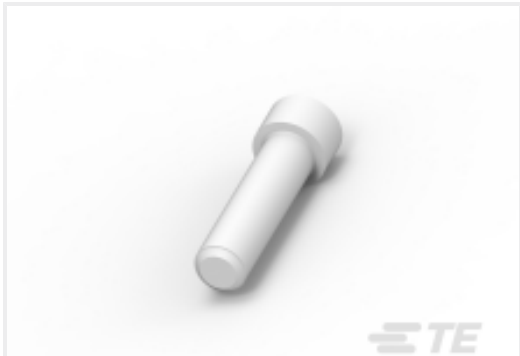
TE Part #114017-ZZ SEALING PLUG, SIZE 12/16, WHT