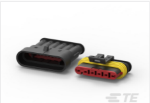
TE Part #CAT-AM71-CH8172 AMP SUPERSEAL 1.5MM, CONNECTOR HOUSING