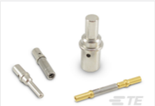
TE Part #CAT-D48-ST273 DEUTSCH Solid Contacts