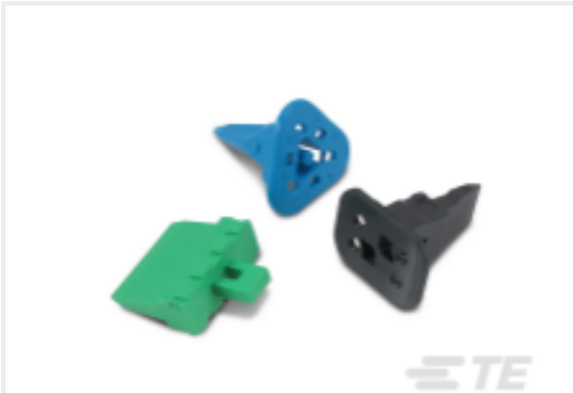
TE Part #CAT-D487-W416 Wedgelocks: DEUTSCH DT