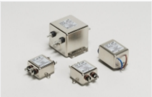
Single Phase Filters(27)