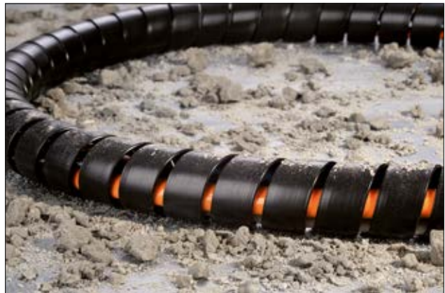
Spiral binding - extremely robust and abrasion resistant.