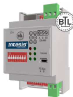
Hitachi to BACnet/IP & MS/TP - 1 indoor unit

The Hitachi-BACnet interface allows full bidirectional communication between Hitachi VRF units and BACnet/IP or MS/TP networks. The interface enables BACnet communication via polling or subscription requests (COV), making the indoor unit available through independent BACnet objects. A wired remote controller can also be connected.