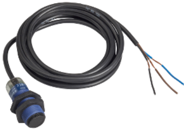
photo-electric sensor - XUB - emitter - 12..24VDC - cable 2m