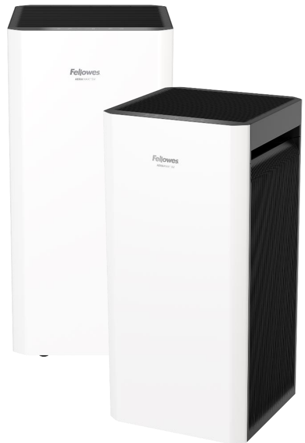
Item # 9799601 Dimensions: 793 x 370 x 370mm