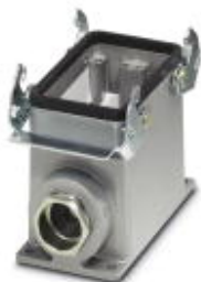
Box mounting base, for double locking latch, height 81 mm, with screw connection, 1x Pg29

Please be informed that the data shown in this PDF Document is generated from our Online Catalog. Please find the complete data in the user's documentation. Our General Terms of Use for Downloads are valid ( http://phoenixcontact.com/download )