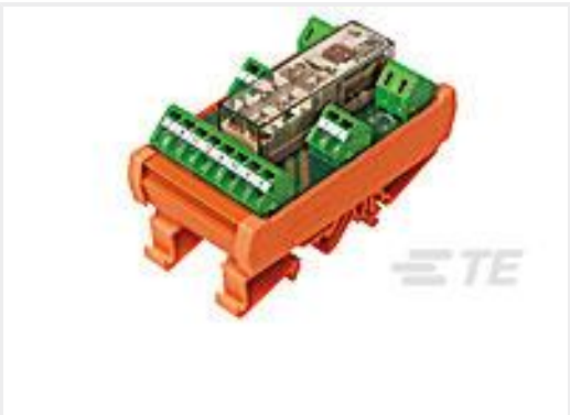
TE Part #3-1415042-1 SR6ZC024