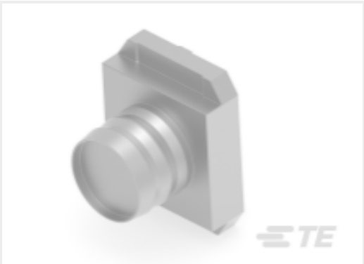
TE Part #2-2308348-3 CRIMP FLANGE 13 LARGE