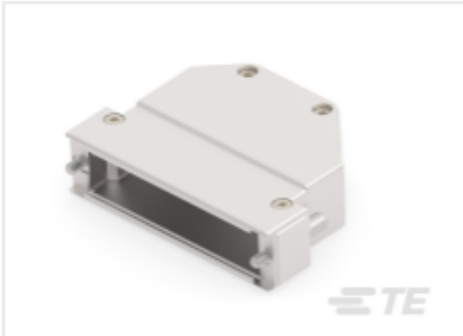
TE Part #1-2308346-3 FULL METAL HOODS SIZE 5 - 3 (RAW)