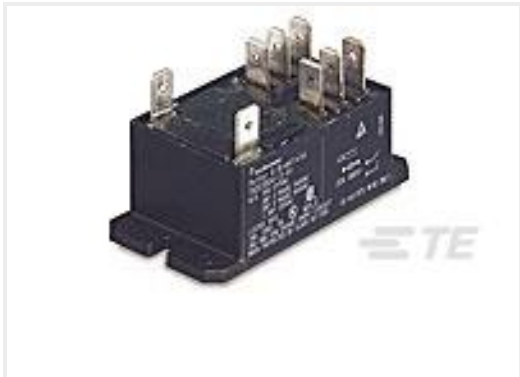
TE Part #6-1393211-2 T92P7A22-240