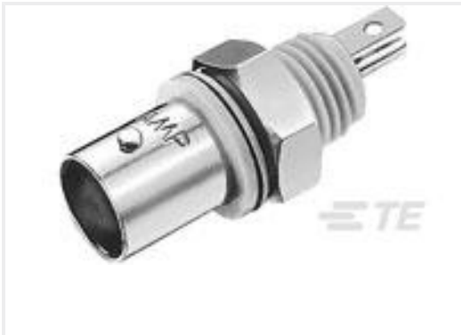
TE Part #5227726-2 ISOLATED BNC SOLDER JACK ASSY