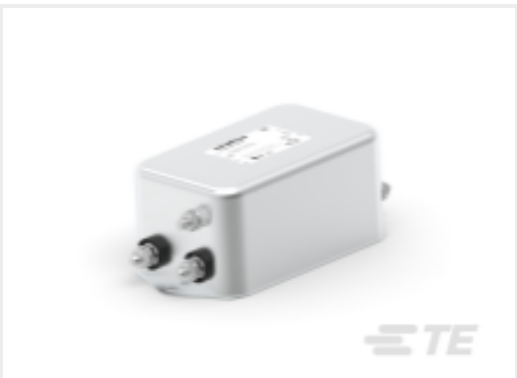
TE Part #803179-SF FN2090-30-08