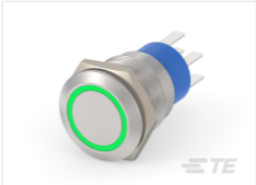
TE Part #5-2213767-5 AV19 DPM 3A MOVE RING LED GREEN 24V