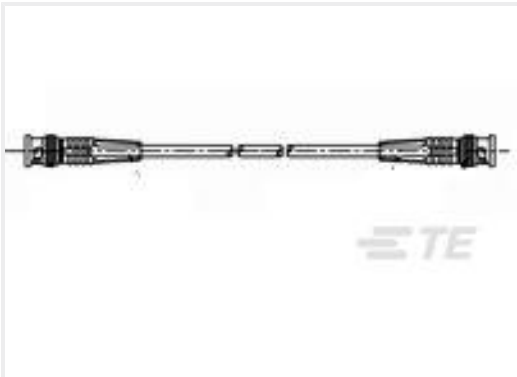
TE Part #1337769-5 50 OHM COAX BNC STR PLUG P99-E