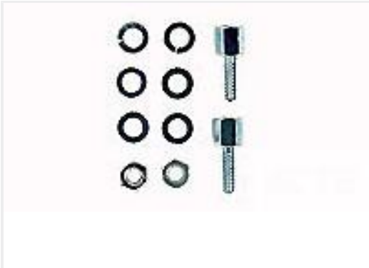
TE Part #5207719-1 KIT SCREWLOCK FEMALE