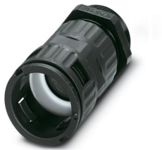
Cable gland, Pg thread, IP68/69k protection, with strain relief

https://www.phoenixcontact.com/in/products/3240935