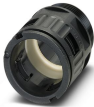
Cable gland, Pg thread, IP68/69k protection, straight

https://www.phoenixcontact.com/in/products/3240879