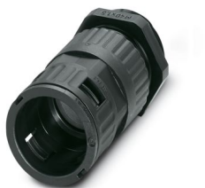
Cable gland, metric thread, IP66 protection, with strain relief

https://www.phoenixcontact.com/in/products/3240957