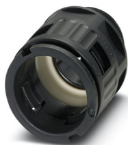
Cable gland, metric thread, IP68/69k protection, straight

https://www.phoenixcontact.com/in/products/3240886