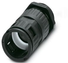
Cable gland, metric thread, IP68/69k protection, with strain relief

https://www.phoenixcontact.com/in/products/3240943