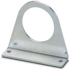
Fixing bracket for protective sleeves, fixed with two screws

https://www.phoenixcontact.com/in/products/3241081