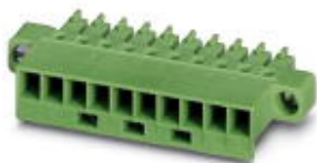
The illustration shows a 16-position version

Plug component, Nominal current: 8 A, Rated voltage (III/2): 160 V, Number of positions: 18, Pitch: 3.81 mm, Connection method: Crimp connection, Color: green, Corresponding female crimp contacts with current [A] and conductor cross section range [mm 2 ] data: 5A/MCC-MT 0,2-0,35 (1859988); 8A/MCC-MT 0,5-1,0 (1859991)