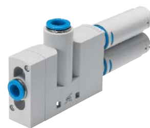
VN-30 with open silencers

Especially suitable for cases where there is heavy demand for vacuum and the intake air is dirty: The open silencers fitted as standard guarantee maintenance-free operation and a low noise level. Optional silencer sets can be fitted in cases where the maximum silencing effect is required.