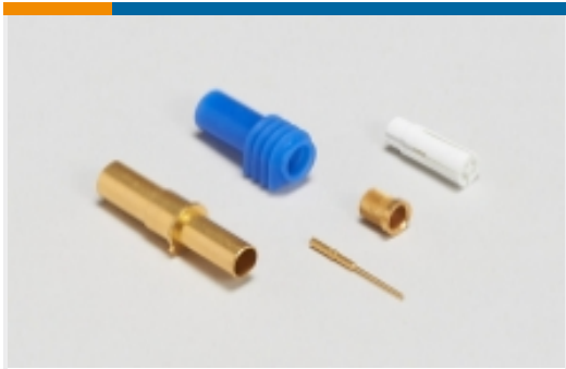
Rack & Panel Contacts(20)