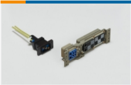
Rack & Panel Connectors(68)