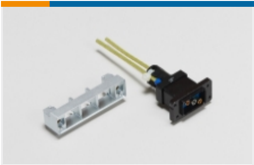
Other Rack & Panel Accessories(2)

on SVHC in articles for this part number is based on the latest European Chemicals Agency (ECHA) ‘Guidance on requirements for substances in articles’ posted at this URL: https://echa.europa.eu/guidance-documents/guidance-on-reach