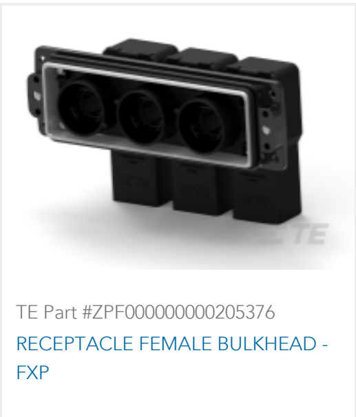
TE Part #ZPF000000000205376 RECEPTACLE FEMALE BULKHEAD - FXP