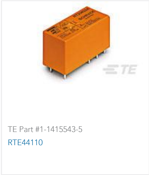
TE Part #1-1415543-5 RTE44110