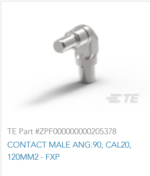
TE Part #ZPF000000000205378 CONTACT MALE ANG.90, CAL20, 120MM2 - FXP