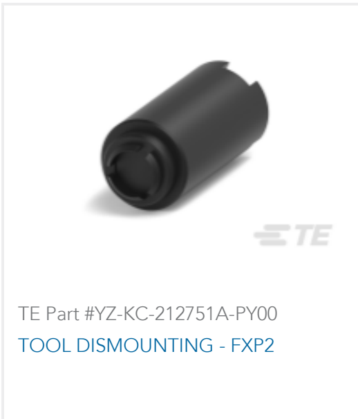
TE Part #YZ-KC-212751A-PY00 TOOL DISMOUNTING - FXP2

Product Drawings PIN CONTACT,SIZE 16 GPR English