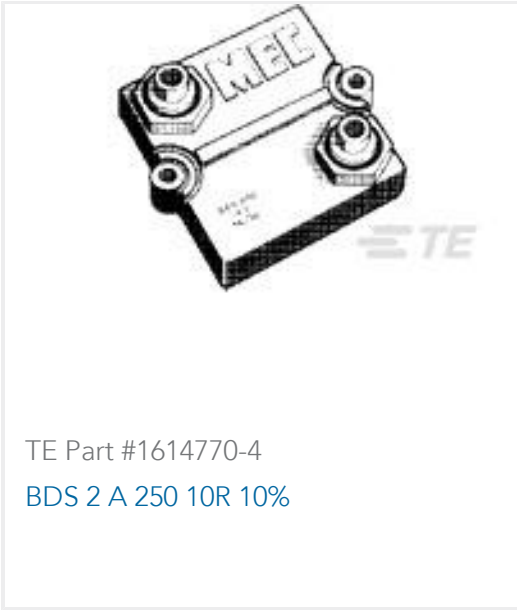
TE Part #1614770-4 BDS 2 A 250 10R 10%