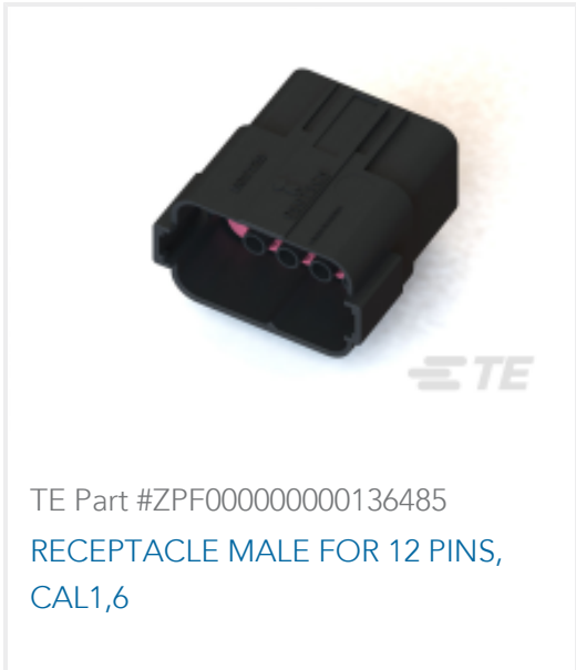
TE Part #ZPF000000000136485 RECEPTACLE MALE FOR 12 PINS, CAL1,6