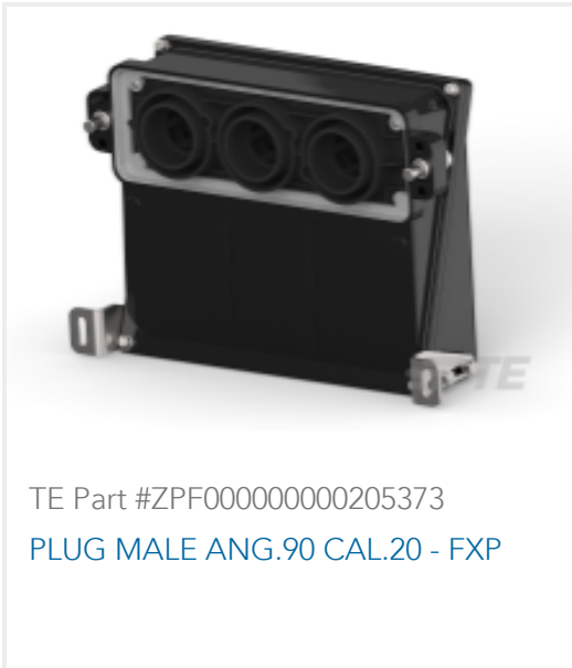
TE Part #ZPF000000000205373 PLUG MALE ANG.90 CAL.20 - FXP