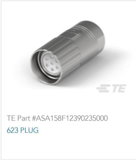
TE Part #ASA158F12390235000 623 PLUG