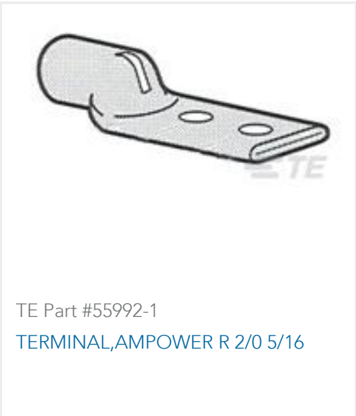
TE Part #55992-1 TERMINAL,AMPOWER R 2/0 5/16