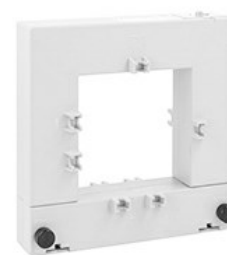
Current transformers DM2TA0400