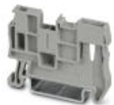
Self-locking flange, Width: 5.2 mm, Height: 35.3 mm, Color: gray, Mounting type: NS 35/7,5, NS 35/15

Self-locking flange - ST 2,5/1P-FS - 3061376