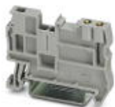
Screw flange, for screwing COMBI plugs, with the same structure and pitch as the relevant COMBI terminal blocks

Self-locking flange - ST 2,5/1P-FS - 3061376