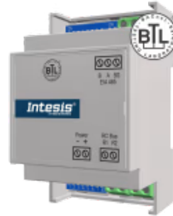
Panasonic to BACnet MS/TP - 1 indoor unit

The Panasonic-BACnet interface allows full bidirectional communication between Panasonic ECOi and PACi air conditioner units and BACnet MS/TP networks. It enables BACnet communication via polling or subscription requests (COV), making the indoor unit available through independent BACnet objects. A wired remote controller can also be connected.