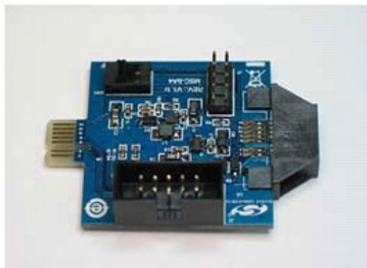
Figure 1. Burning Adapter Board (P/N MSC-BA4)