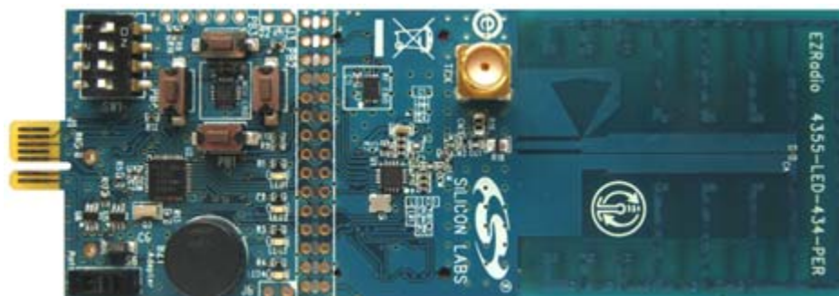
Figure 4. Si4355 RFStick 434 MHz Receiver Board (P/N 4355-LED-434-SRX)

Note: Instead of this board, the 434 MHz development kits may contain the pcb antenna version of this board called the Si4010 key fob development board 434 MHz (P/N 4010-DKPB_434).