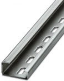
G-profile DIN rail, material: Steel, perforated, height 15 mm, width 32 mm, length 2 m

Please be informed that the data shown in this PDF Document is generated from our Online Catalog. Please find the complete data in the user's documentation. Our General Terms of Use for Downloads are valid ( http://phoenixcontact.com/download )