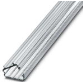
Cover profile, length: 300 mm, color: transparent

Please be informed that the data shown in this PDF Document is generated from our Online Catalog. Please find the complete data in the user's documentation. Our General Terms of Use for Downloads are valid ( http://phoenixcontact.com/download )