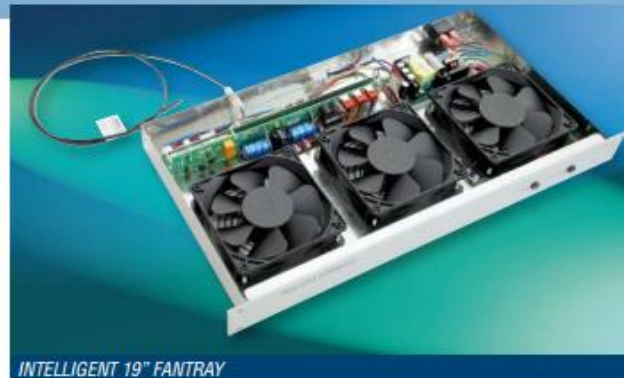
INTELLIGENT 19" FANTRAY

The Intelligent fan tray will not operate without the Thermal Sensor(s) which are available in different lengths to suit the required position(s) within the rack.