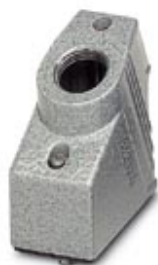
Powder-coated sleeve housing, with metric cable entry, locking screws with cylinder head

Please be informed that the data shown in this PDF Document is generated from our Online Catalog. Please find the complete data in the user's documentation. Our General Terms of Use for Downloads are valid ( http://phoenixcontact.com/download )