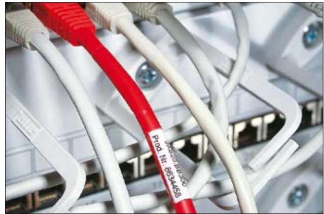
Self-laminating labels offer an excellent protection against abrasion and environmental impact.