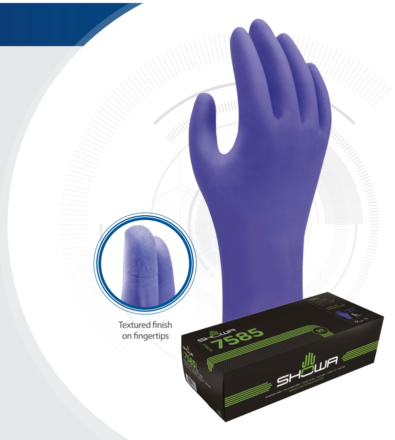
Textured finish on fingertips