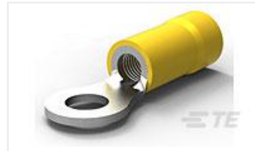
TE Part #34854 TERMINAL,PG R 12-10 10