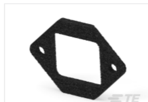
TE Part #DTP4P-L012-GKT GASKET, 4P, BLK, DTP