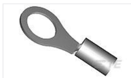
TE Part #160293 PLASTI-GRIP, RING, 12-10 5MM