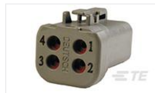
TE Part #DTP06-4S-E003 PLG, 4P, GRY, N, CAP