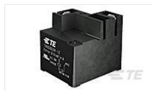
TE Part #6-1419102-4 T9AP5D52-48