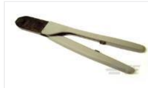
TE Part #91517-1 CCII FEMALE MOD IV REC 24-22 ASSY