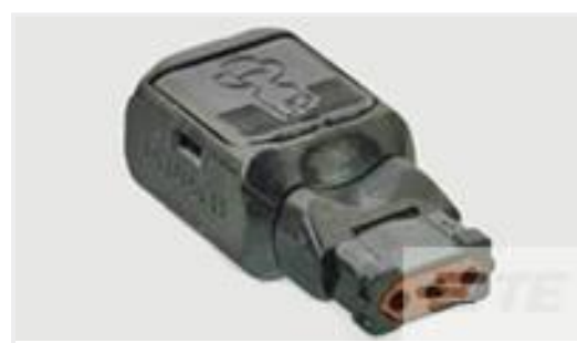
TE Part #D369-P33-CP1 369 3 WAY PLUG, CRIMP, PIN