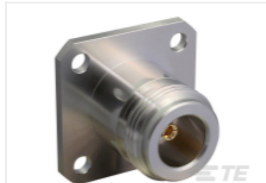
TE Part #CONN003-W N Type Jack 50 Ohm Panel Mount