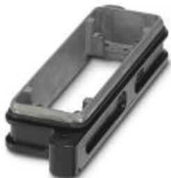
HEAVYCON B16 panel mounting base, HPR series, for screw locking, for increased environmental and EMC requirements

Please be informed that the data shown in this PDF Document is generated from our Online Catalog. Please find the complete data in the user's documentation. Our General Terms of Use for Downloads are valid ( http://phoenixcontact.com/download )