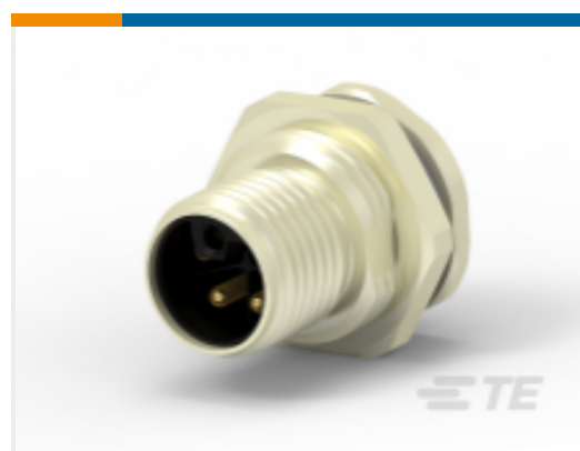
TE Part # T4140L12051-000 M12, REAR MOUNT, MALE, L, 4P+PE, SOLDER PCB