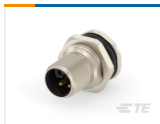
TE Part # T4140L12051-001 M12, REAR, MALE, L, 4P+PE, LONGER, SOLDER PCB