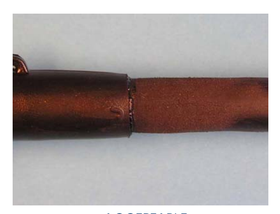
ACCEPTABLE 360° flow of adhesive