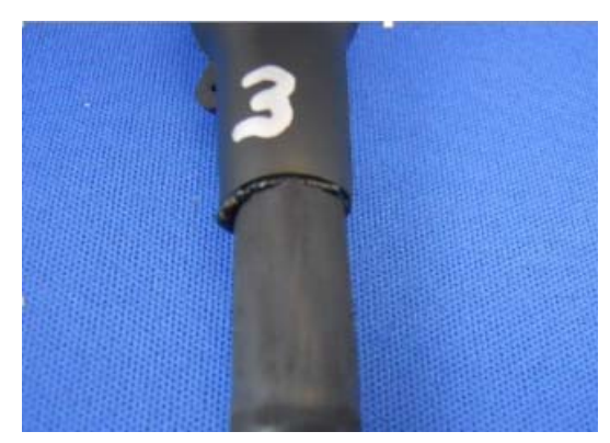
ACCEPTABLE Evidence of flow