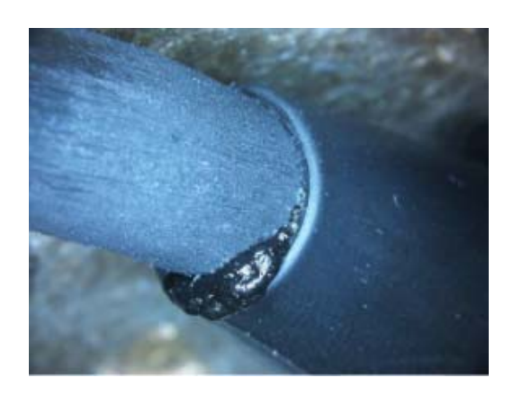
ACCEPTABLE Evidence of flow