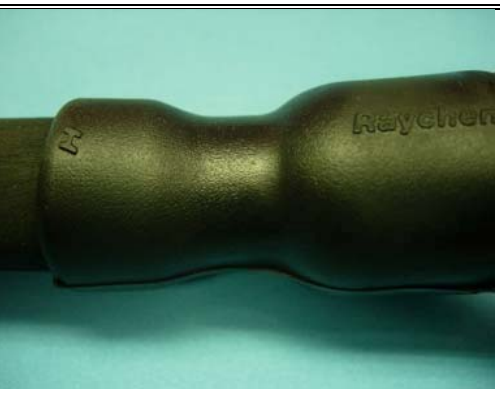
NOT ACCEPTABLE Necking