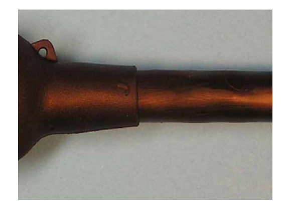
NOT ACCEPTABLE No evidence of adhesive flow