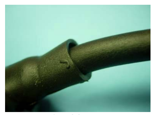
NOT ACCEPTABLE Under Recovered

Although illustrations in this COP show straight moulded parts the above instructions are also applicable for 45° and 90° moulded parts.