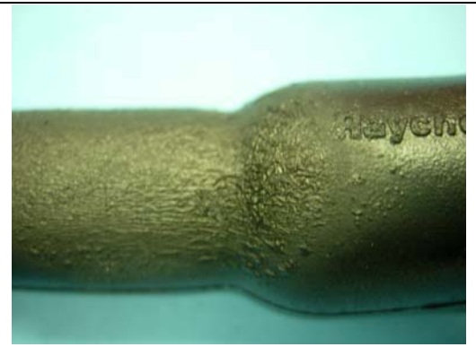
NOT ACCEPTABLE Scorch marks

Title – Installation of /225 Coated Straight and 90° Moulded Parts using a Hot Air Gun.