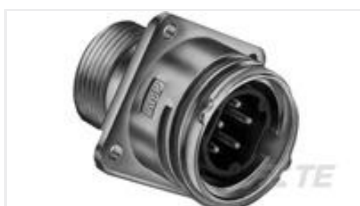
TE Part #208459-1 CMC RECPT ASSEMBLY SIZE 28