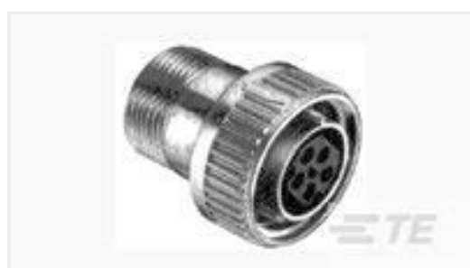
TE Part #208457-1 CMC PLUG ASSEMBLY,SZ 28-24