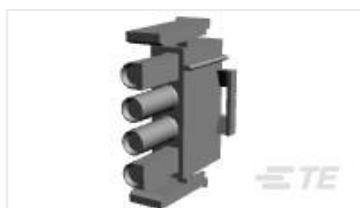
TE Part #1-480702-9 04P UMNL PLUG HSG BLK