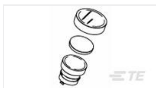
TE Part #7-1437569-3 64E3=COLOR PB CAP ORANGE ROUND