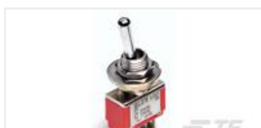
TE Part #3-1825139-9 A211SYZQ04