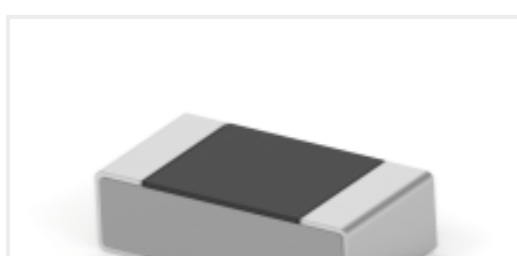
TE Part #9-1879140-6 RN 0603 182K 0.1% 10PPM 5K RL