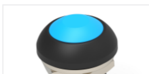
TE Part #2329383-5 PB OFF/ON FC BLU M1 TERM. IP68