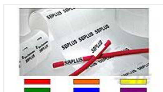
TE Part #CN9921-000 SBP100225WE2.5-T200