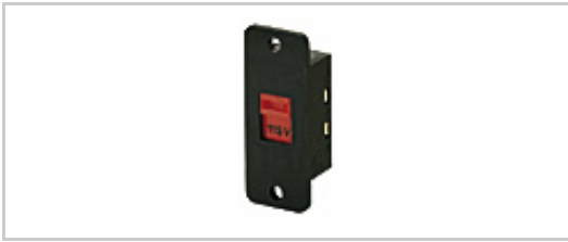
Similar to original product