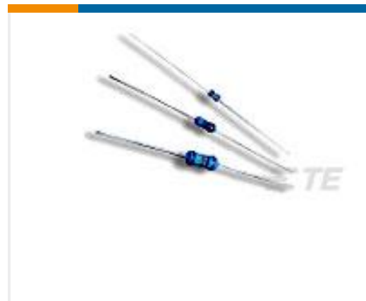
TE Part #1622298-1 LR1 1% 10K