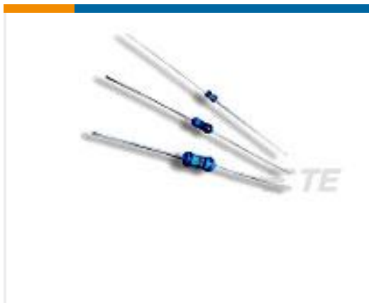
TE Part #1622349-1 LR1 1% 1K0