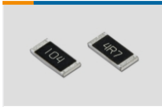
Surface Mount Resistors (646)