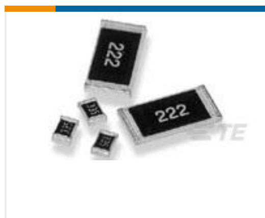
TE Part #1623525-1 CRG1206 1% 4K7