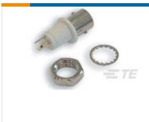
TE Part #5-1634504-1 BNC Ins BHSkt 50Ohm Nickel Gold Pltd