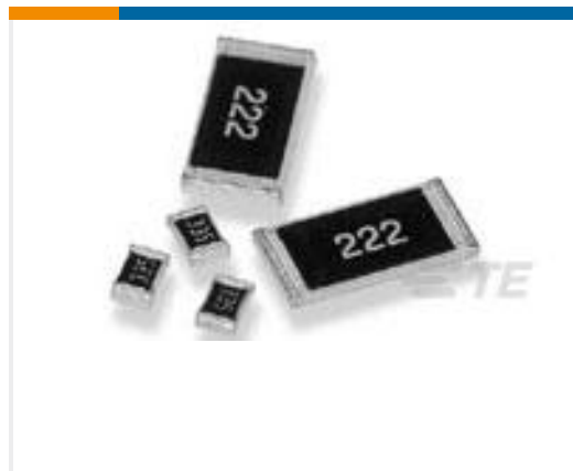
TE Part #1623440-1 CRG1206 1% 1K0