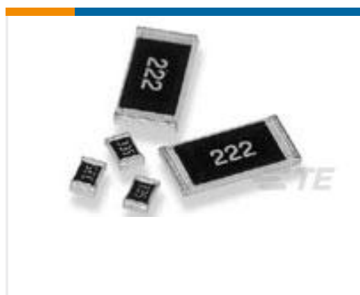
TE Part #1623402-1 CRG1206 1% 100K