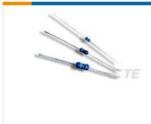
TE Part #1622296-1 LR1 1% 100K