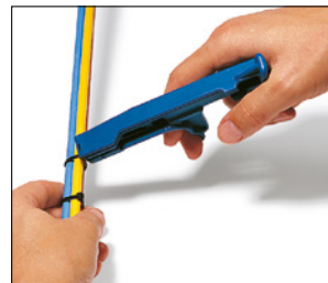
Twist to cut.